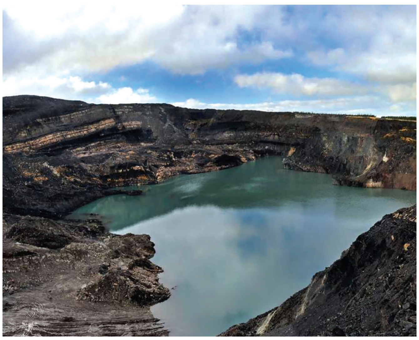
Figure 2. Large flooded hole with steep wall at Dunstonhill opencast coal mine in April 2013 after being abandoned.

So how about the existing oil and gas projects in Vietnam that have been operated for more than 10 or 20 years? Since the decommissioning and abandonment provision approach has been applied to them, the government in collaboration with PVN needs to check the balance of the financial guarantee fund for each project and monitors the site to assess the outstanding decommissioning liability. If the fund is inadequate for undertaking the outstanding work, the operator must add to the fund immediately or as soon as possible. This is especially important for projects executed via joint ventures or production sharing contracts between PVN and international firms since the latter may go into liquidation at any time. It is not only reasonable but also fair because the projects have lasted more than 10 or 20 years, bringing certain profits to the operators from oil sales.